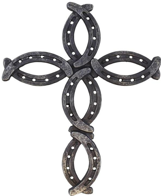
DeLeon Collections Decorative Horseshoe Wall Cross - Rustic Spiritual Art Sculpture Price: $14.99 11 1/2" x 8 1/2"

OFFICERS, ADS, MORE PICTURES: PAGE 6 COLUMBIA, WA, OR. CUP STANDINGS: PAGES 7,8,9 ED WELCH OPEN & CLASSES: PAGES 10- 13 BELLINGHAM INTERNATIONAL & CLASSES: PAGES 14-20 SEATTLE OPEN & CLASSES: PAGES 21-24 SCHEDULE: PAGE 24