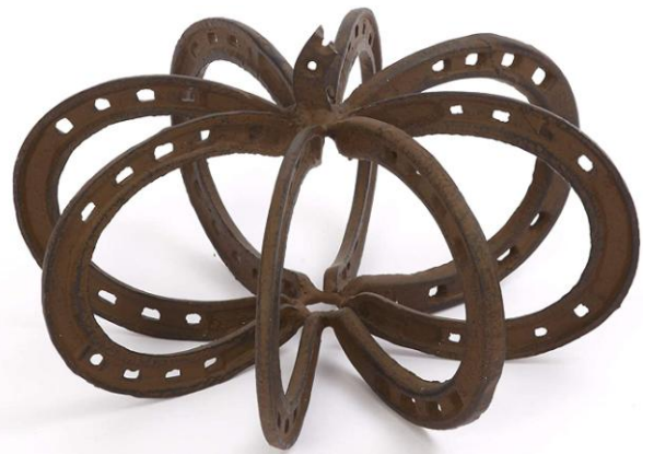
GER Metal Horseshoe Pumpkin, Horseshoe Sculpture in The Shape of a Pumpkin for Fall and Thanksgiving Decor, 9.5 Inches Price: $19.88 Measures 9.5 inches wide x 6 inches high