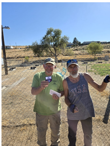
Class B Winners