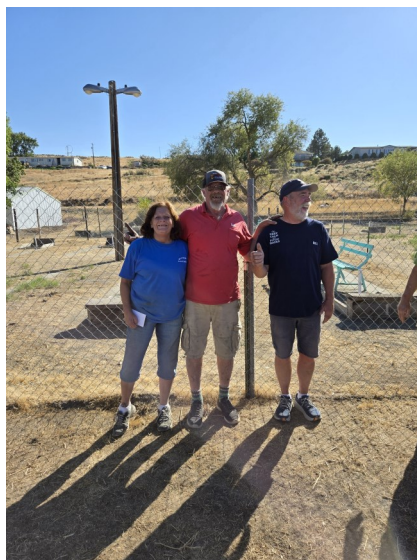
Class A Winners