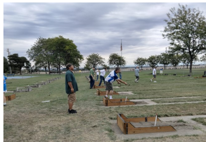
Class B Play-off Game