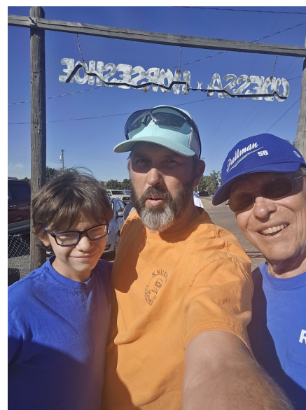
Class C Winners