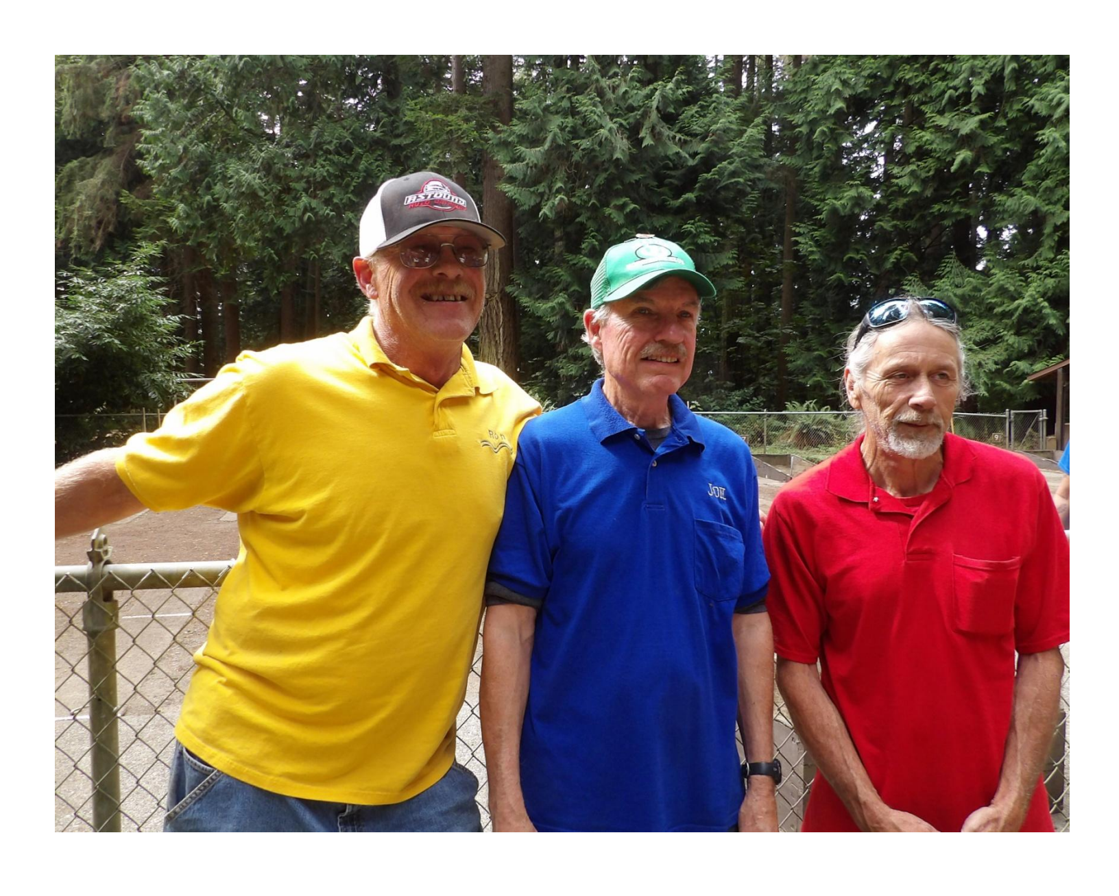
Class A Mens