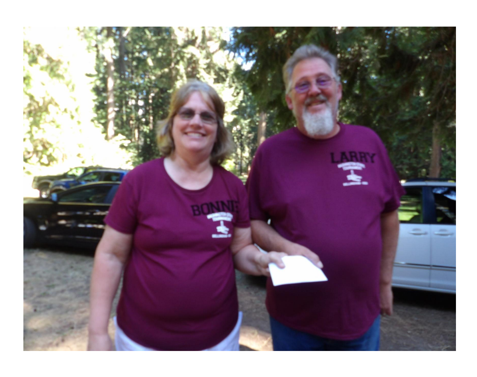
Class A Doubles Champions