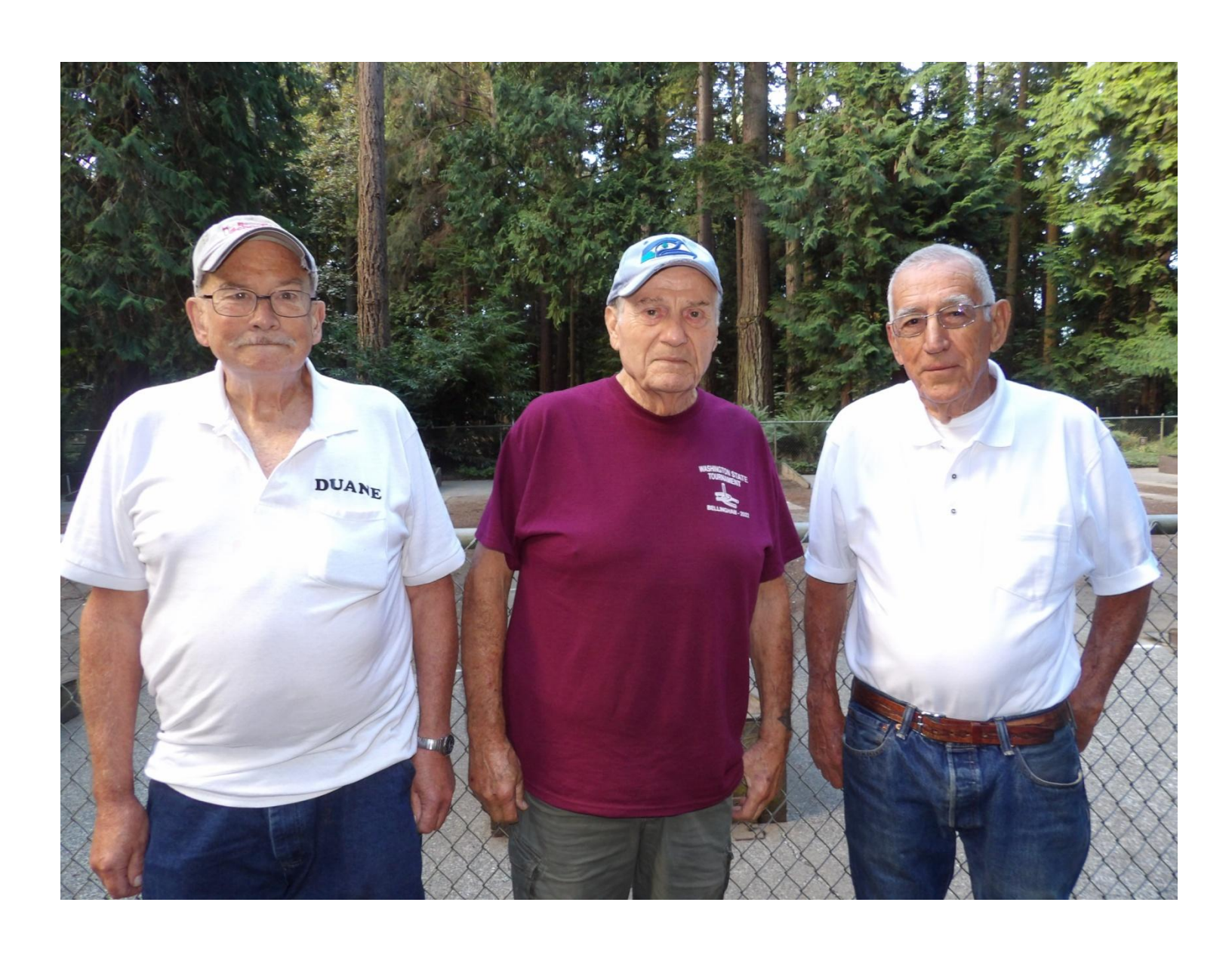
Class A Elders