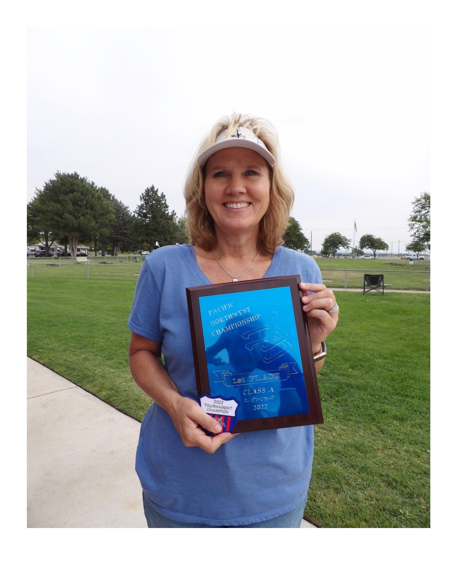
PACIFIC NORTHWEST CLASS A CHAMPION