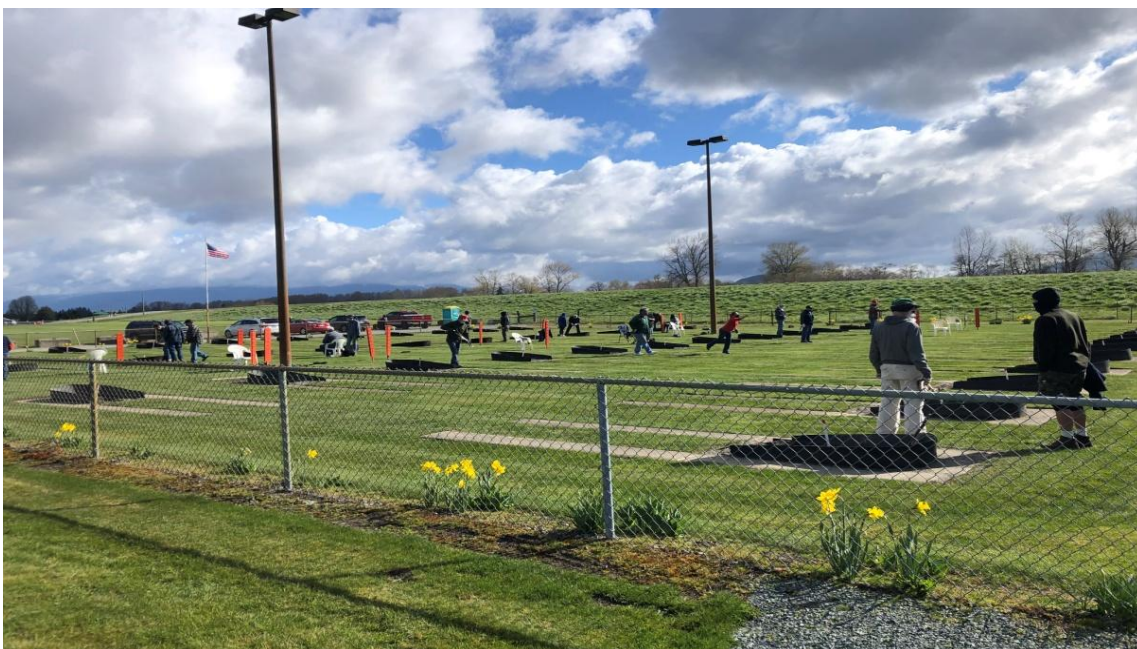
Tulip Open

U.S. Department of Veteran Affairs : "In Flanders Fields" History : "How Did 'Taps' Originate?"