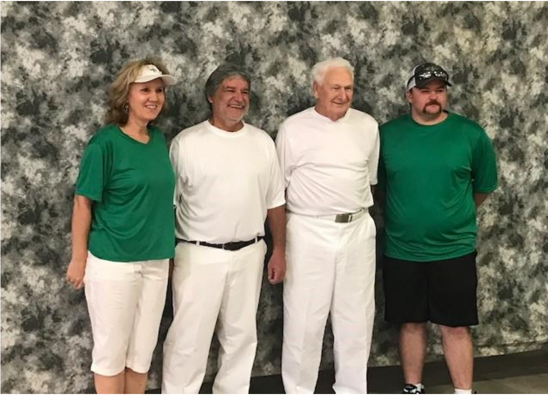
TEAM WORLD 2022