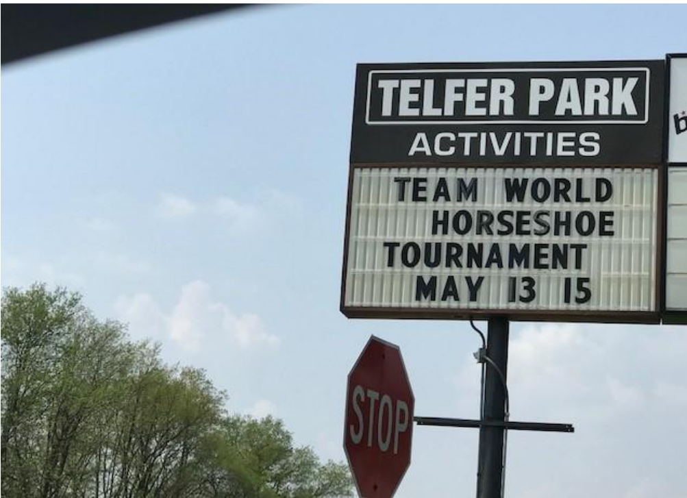
TEAM WORLD HORSESHOE TOURNAMENT BILLBOARD