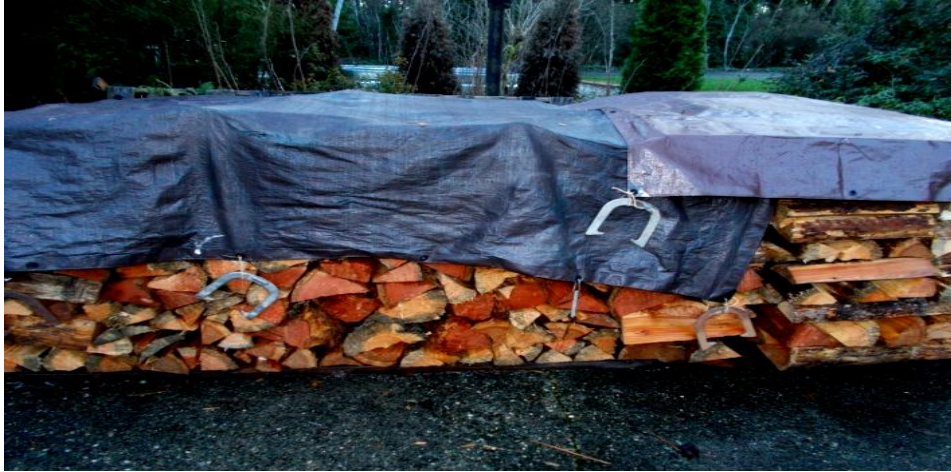
How the Sperbers put their "retired" horseshoes back to work!!