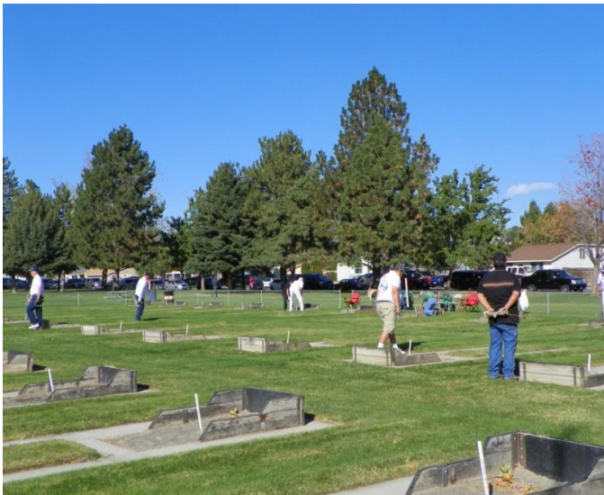
We have always social distanced.