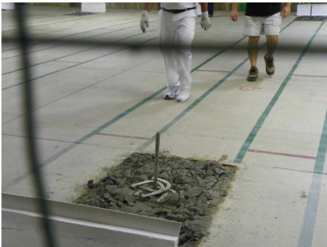
Make sure it's a ringer.