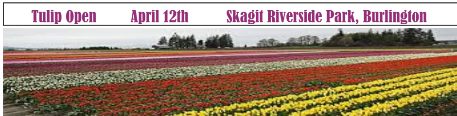
Tulip Open April 12th Skagit Riverside Park, Burlington